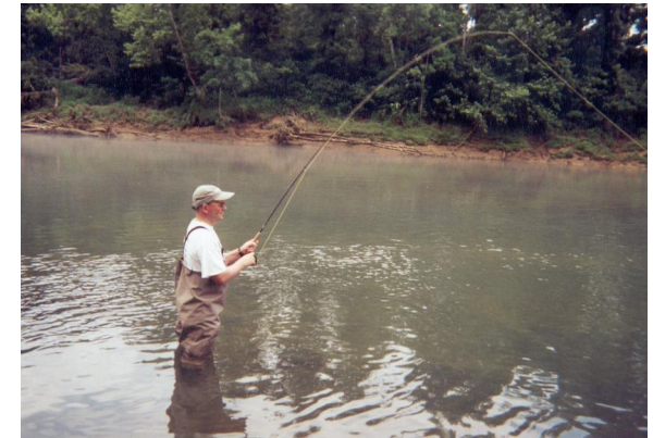
Wade fishing during the summer months.

Begins around sunrise and will last until late afternoon. Most trips depart from Helm's Landing, about four miles downstream from Wolf Creek Dam. You will be fishing out of an Express aluminum boat and possibly enjoy some wading if water conditions are low enough