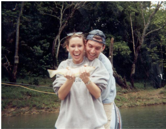
Fly fishing couple enjoying themselves on the river.

The river is fishable nearly all year long, but it is best to book a trip from late spring through the fall due to more stable flows