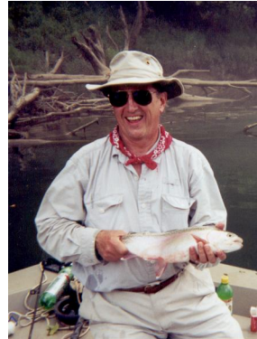
Catching rainbows along flooded timber near Winfrey's Ferry.