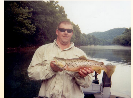
This nice brown fell for a Copper John near the Crocus Creek area.